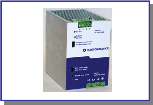
3-PHASE, UNIVERSAL INPUT